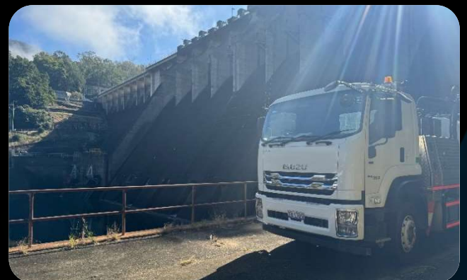
Somerset Dam - GPR scanning and drill mud excavation