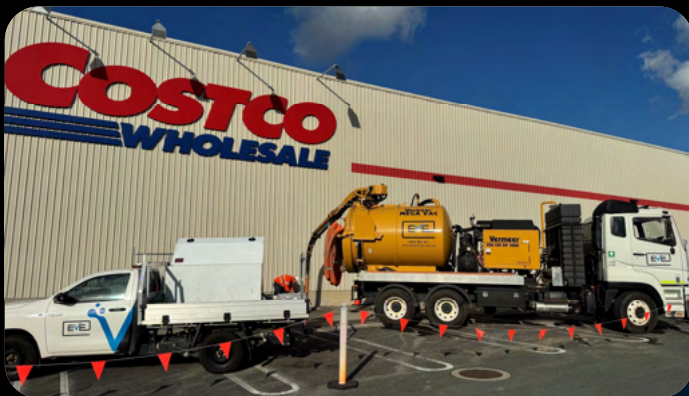
Costco North Lakes – Concrete cutting, and Potholing