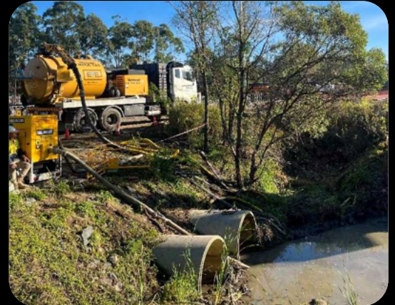
Confined space culvert cleaning and CCTV Inspection