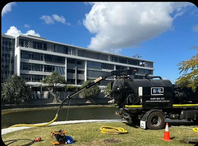
Newstead lakes – Maintenance cleaning and vacuum loading