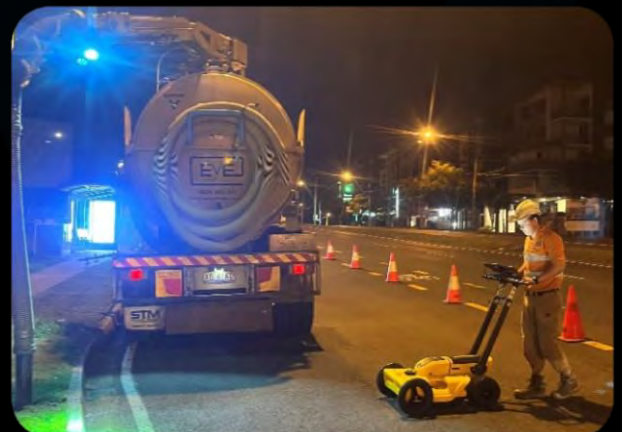
GPR scanning and potholing for PUP investigation