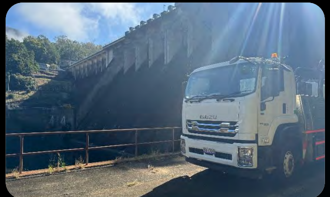
Somerset Dam - GPR scanning and drill mud excavation