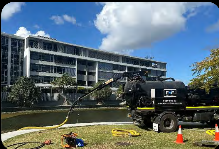
Newstead lakes – Maintenance cleaning and vacuum loading