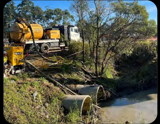
Confined space culvert cleaning and vacuum loading