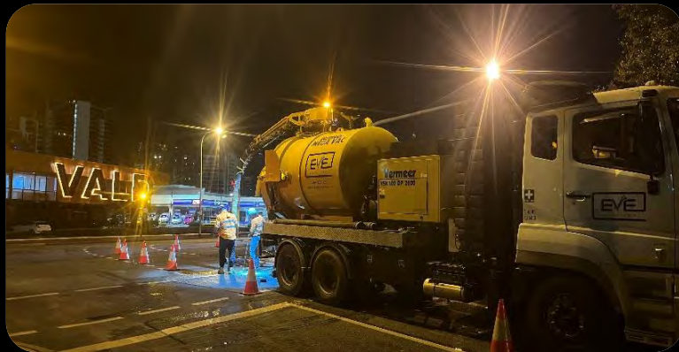
PUP utility investigation – Blackspots program, Breakfast Creek